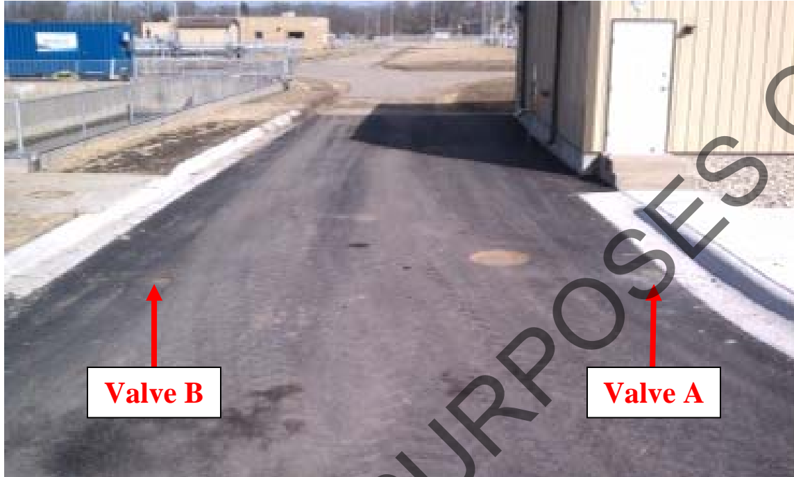
FIGURE 1: Spill Containment Valve Locations